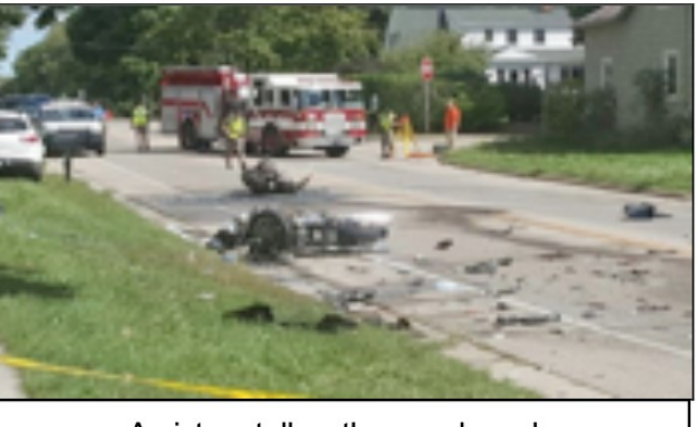
A picture tells a thousand words

This month, the topic is: Assess the Situation.